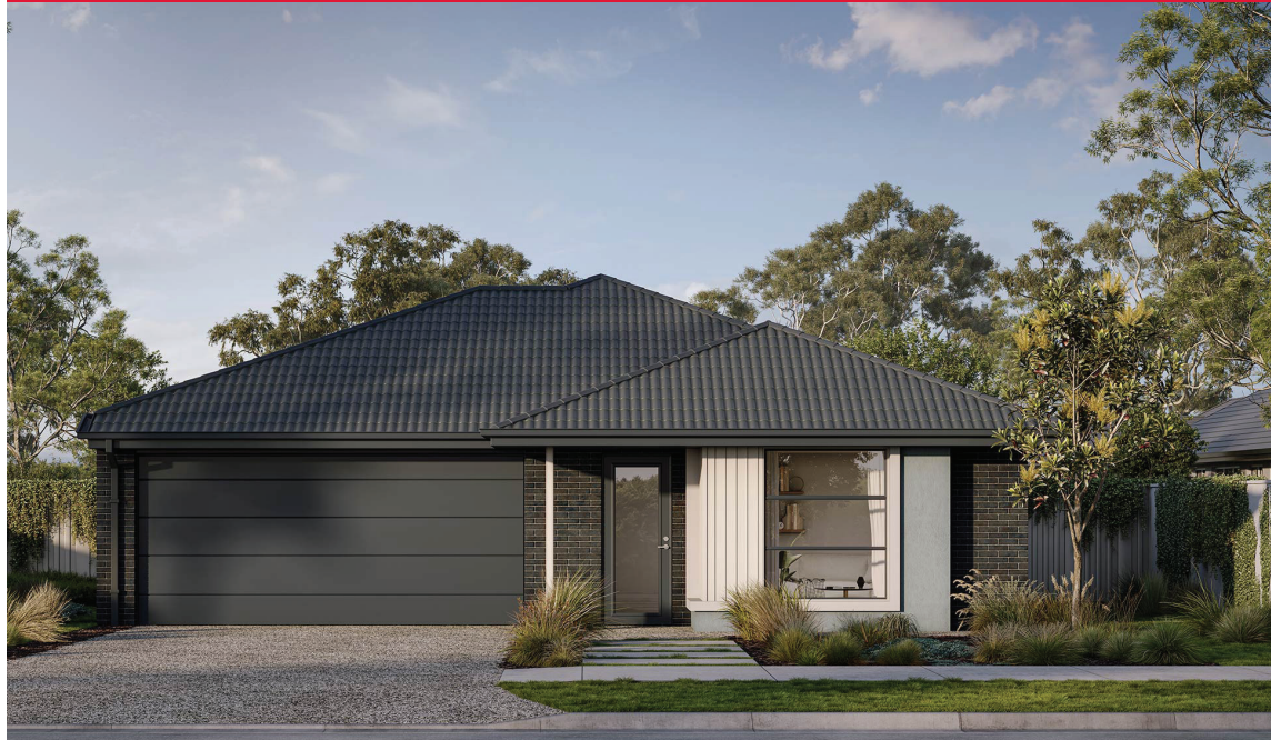
GRANITE 23 | EMERGE RANGE