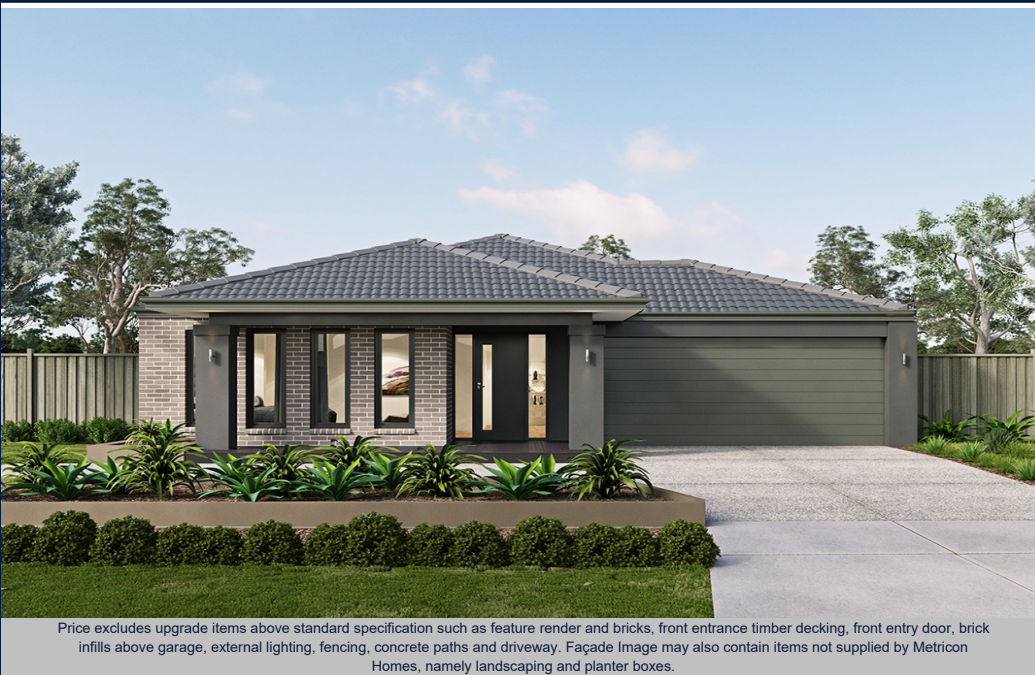
Price excludes upgrade items above standard specification such as feature render and bricks, front entrance timber decking, front entry door, brick infills above garage, external lighting, fencing, concrete paths and driveway. Façade Image may also contain items not supplied by Metricon Homes, namely landscaping and planter boxes.