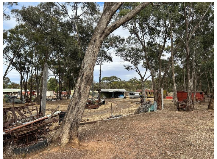
Managed Vegetation View North-West