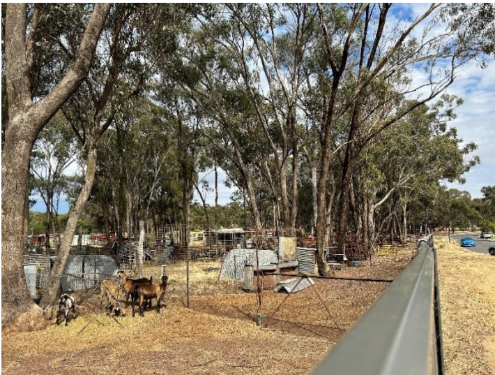
Managed Vegetation View North-West