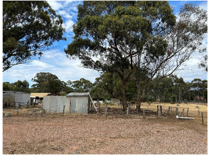
Managed Vegetation – South-West