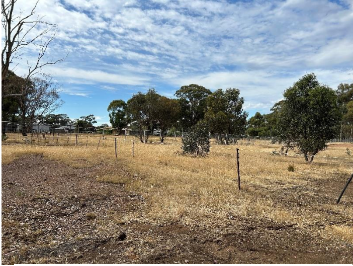
Managed Vegetation – South-West