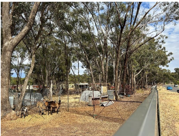
Managed Vegetation View South-West