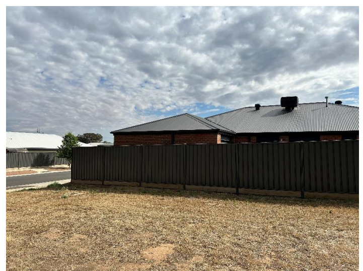
View - North-East