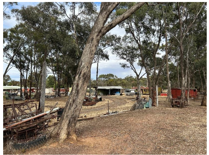
Managed Vegetation View South-West