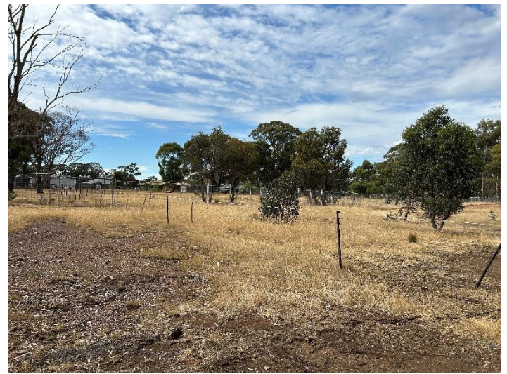
Managed Vegetation - South