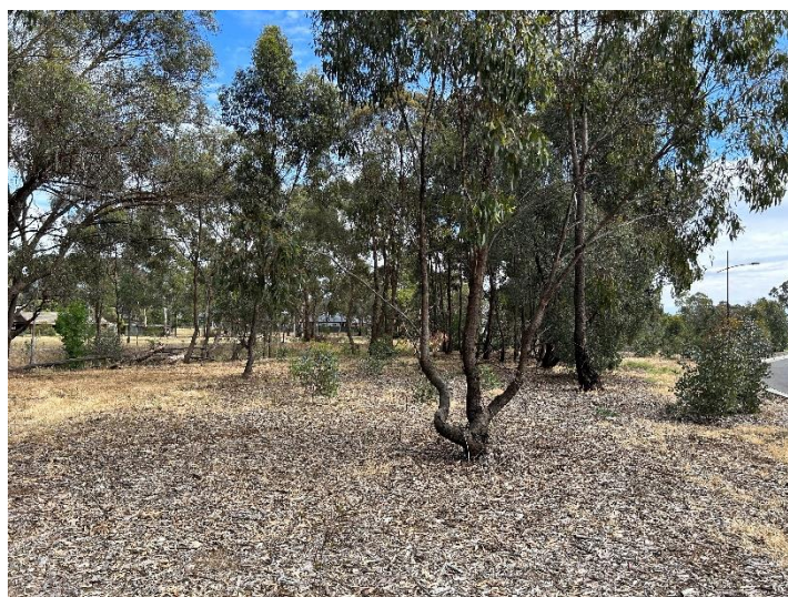
Typical Street Vegetation North-West