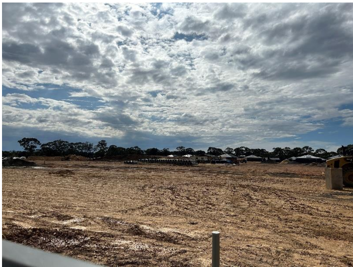
Managed Vegetation - South-East