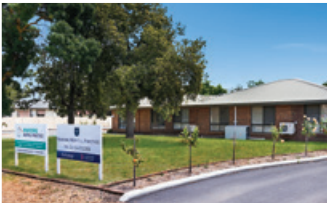
Marong Medical & Dental Practice