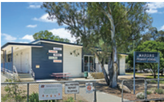
Marong Primary School