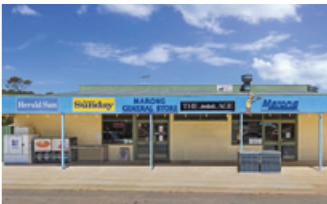
Marong General Store