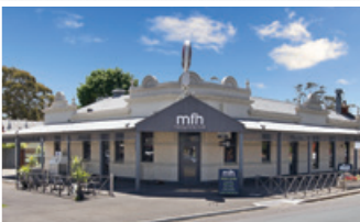
Marong Family Hotel