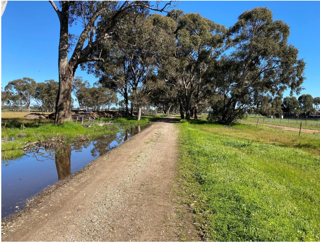
Existing Dirt Road to West