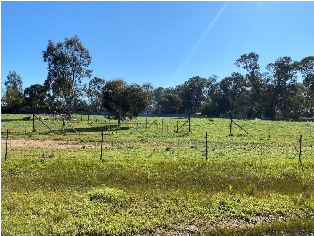
Typical Managed Vegetation North from site