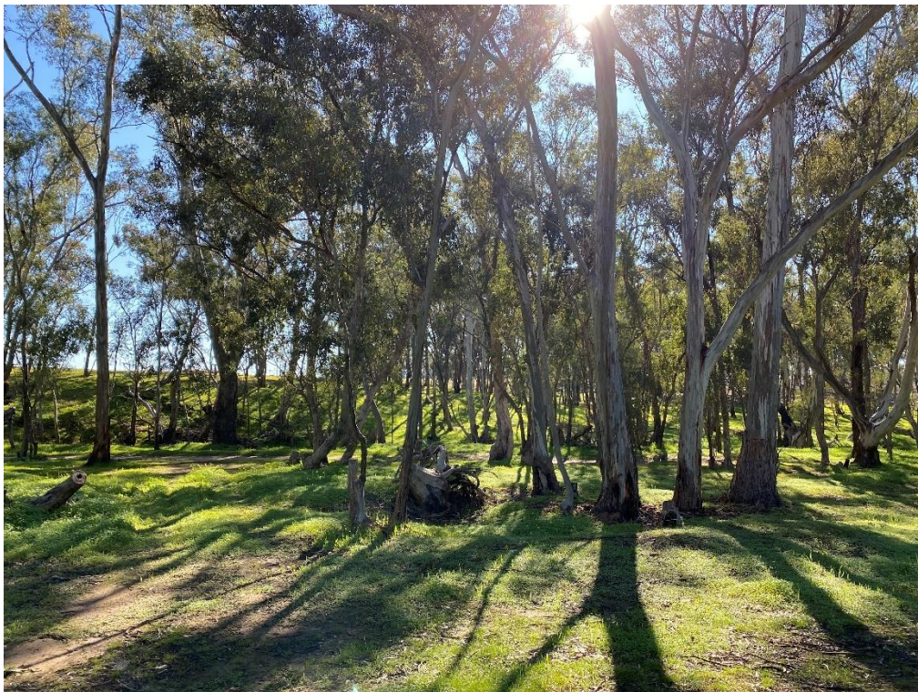
Typical Vegetation 60m North from site