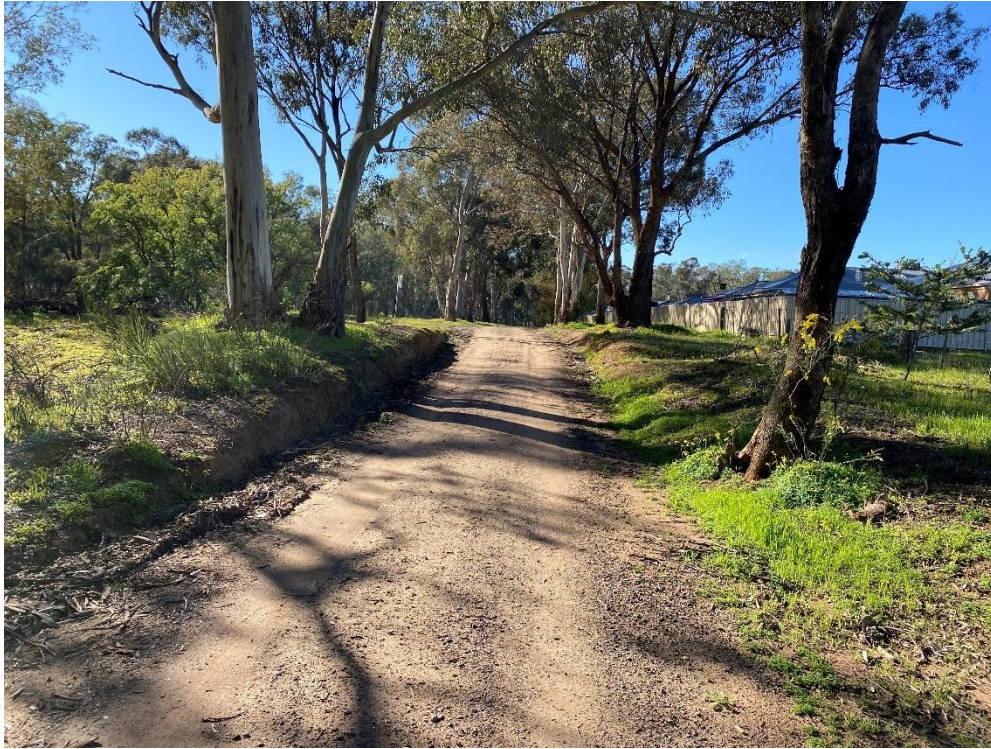
Existing Dirt Road to North