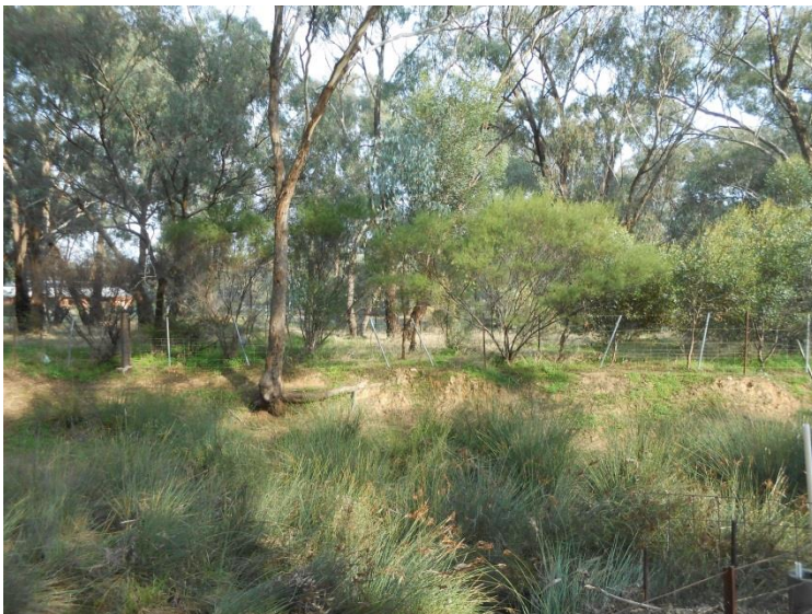
Typical Vegetation along Existing Creek more than 100m from site North-West