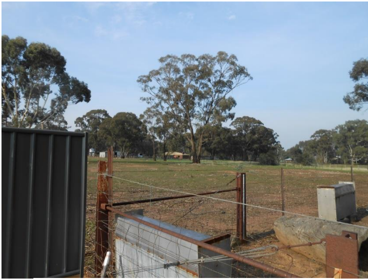
Managed Vegetation South-East