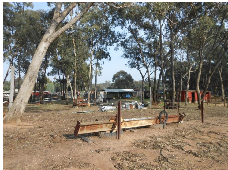
Managed Vegetation South-West