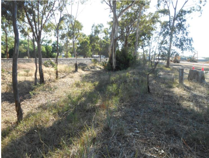
Typical Vegetation along Railway line