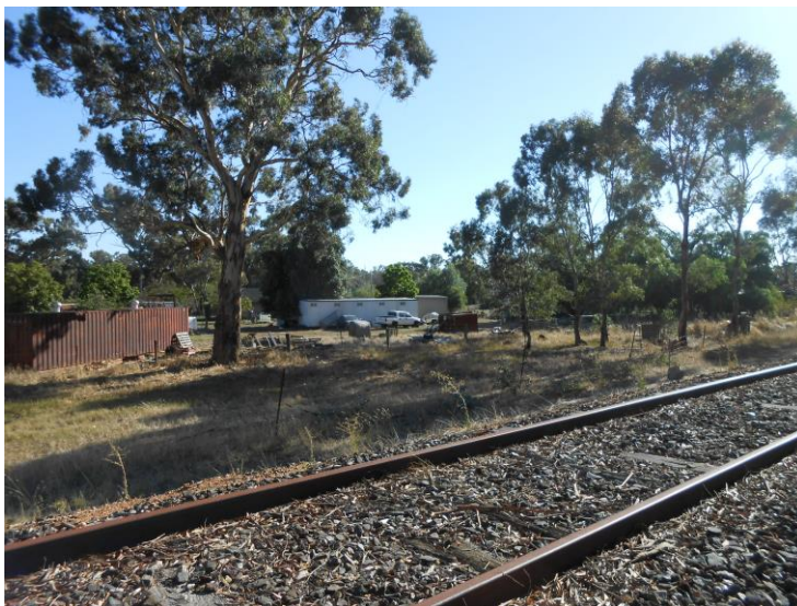
Managed Vegetation adjacent to Railway line