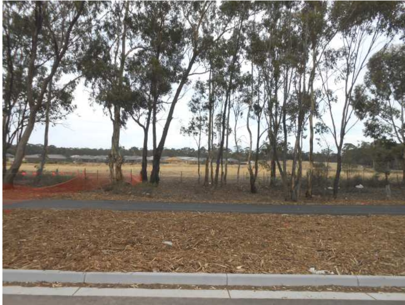
Typical Grassland North-East