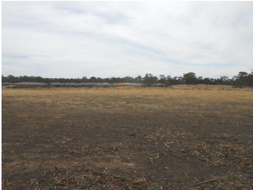
Managed Vegetation North-East