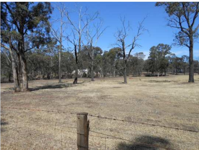
Typical Grassland South-East