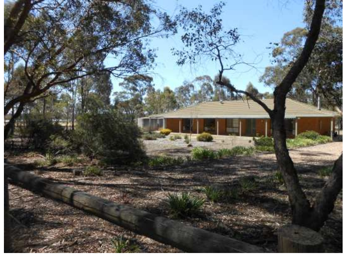
Managed Garden North-East