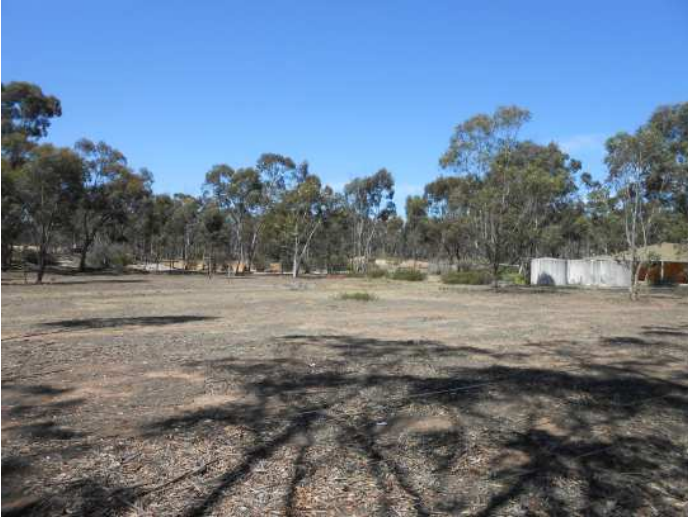
Typical Grassland North-East