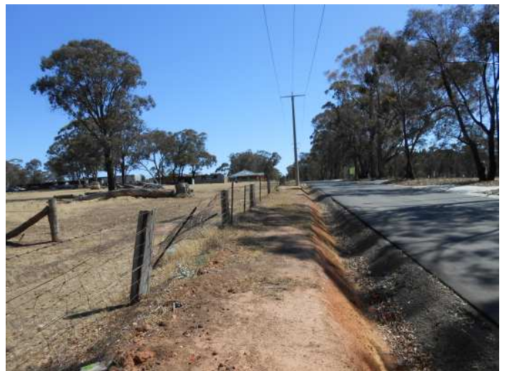
Harvey's Lane South-West