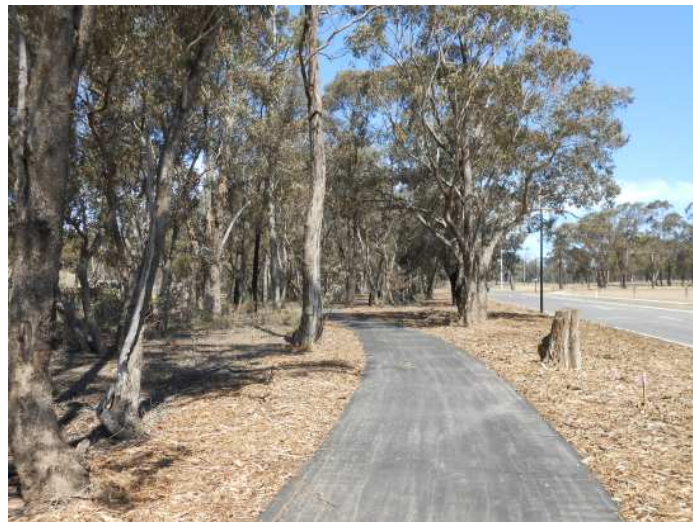
Managed Vegetation North-East