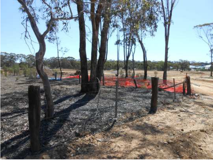
Typical Vegetation South-West