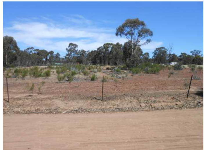
Grassland & Scrub adjacent to dirt track South-West (Very Minimal Cover-Low Threat)