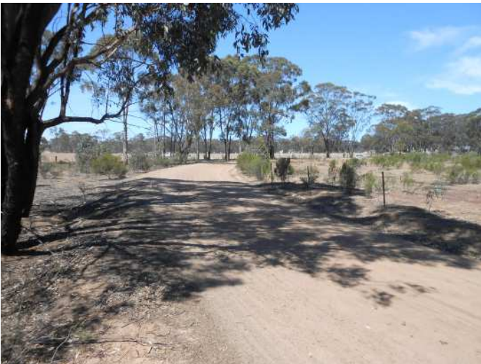
Existing dirt track adjacent to site with minimum vegetation South-West