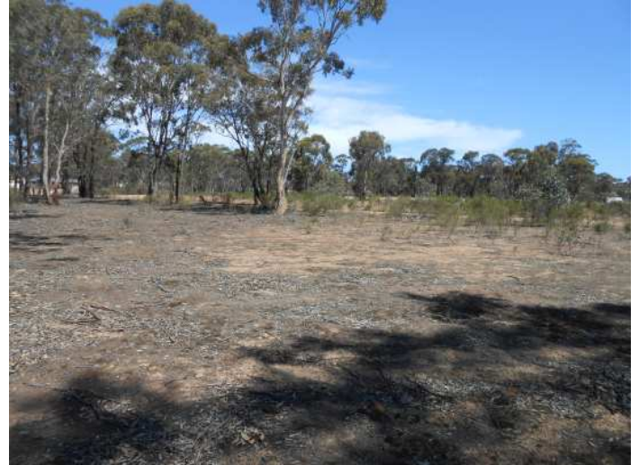
Typical Vegetation South-West