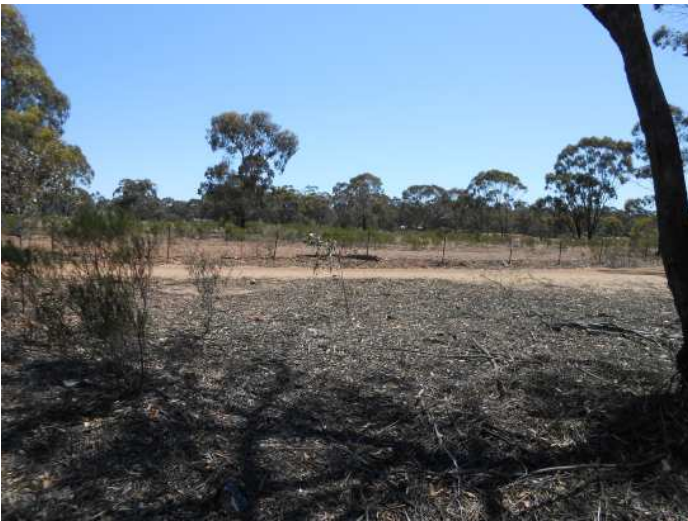
Typical Vegetation South-West