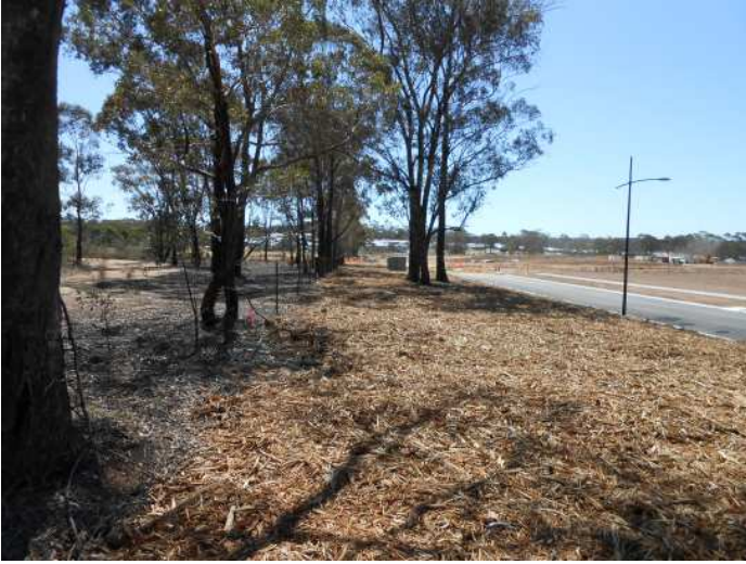
Typical Vegetation South-West