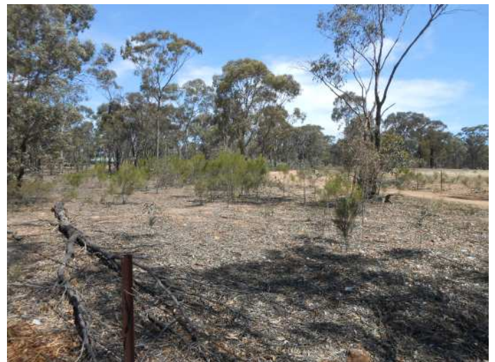
Typical Vegetation South-West