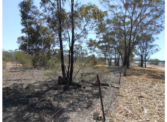
Typical Vegetation South-West