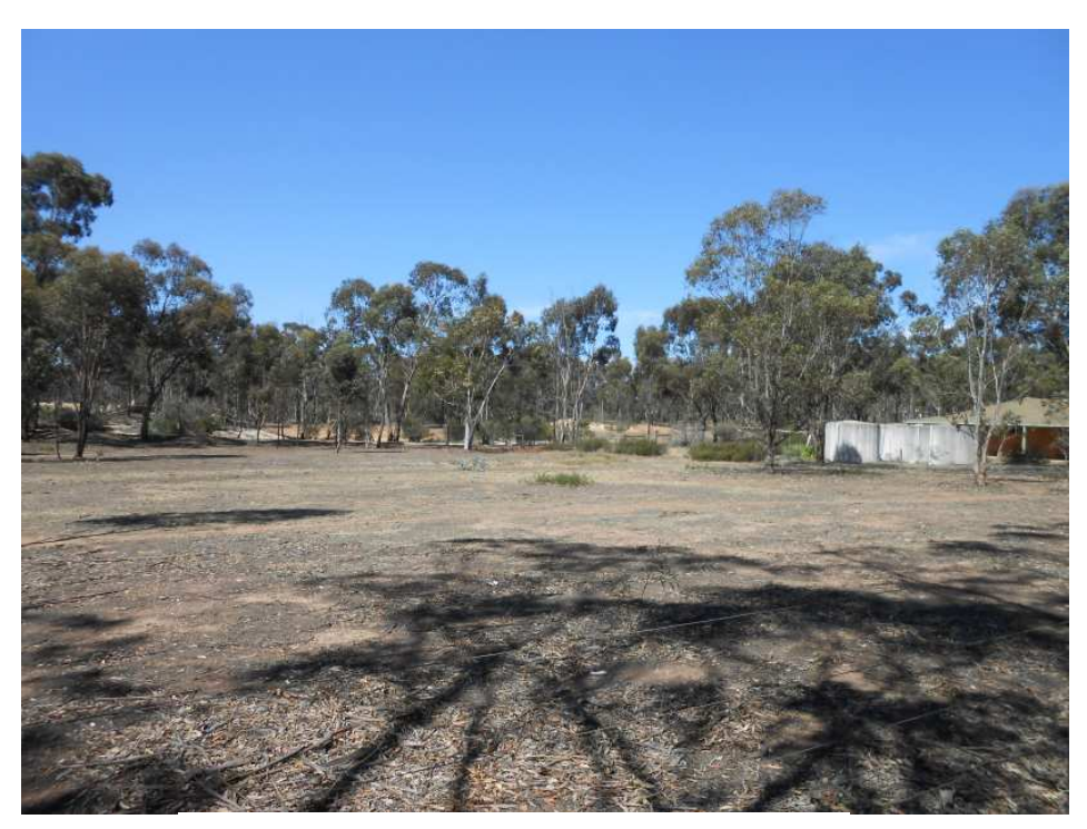
Typical Grassland East