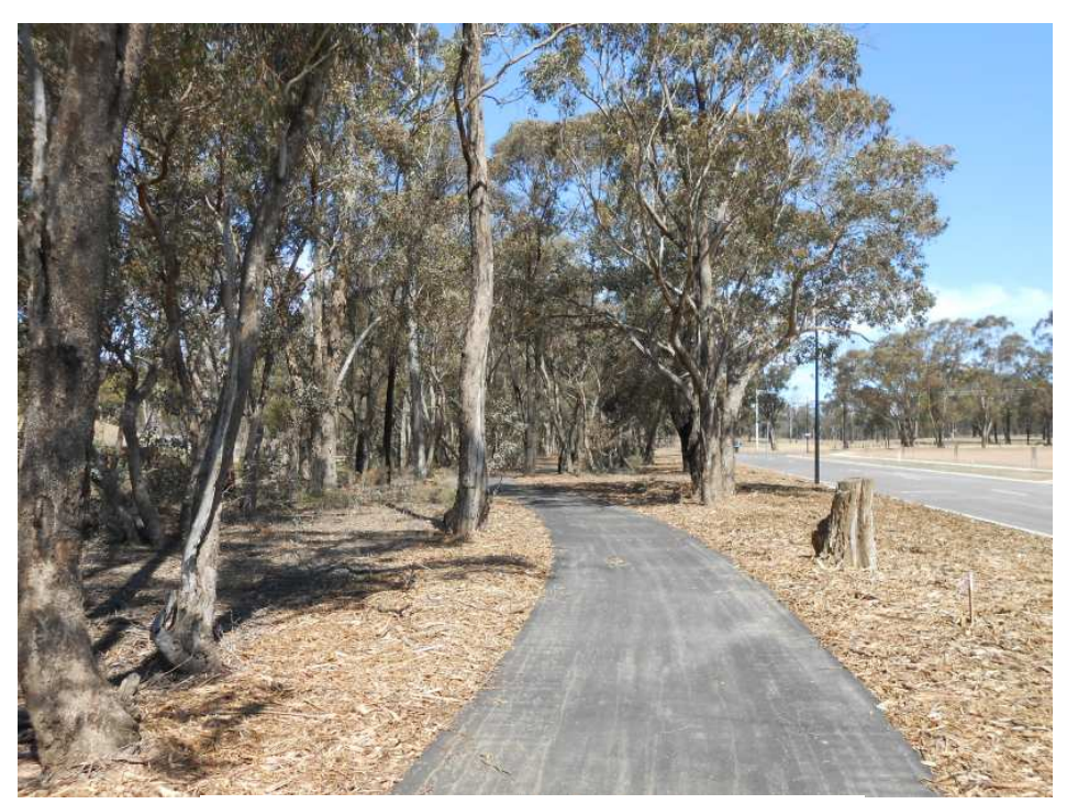
Managed Vegetation East