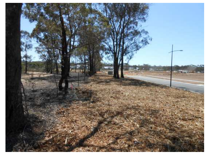
Typical Vegetation South-West