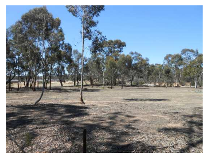
Typical Vegetation North-East