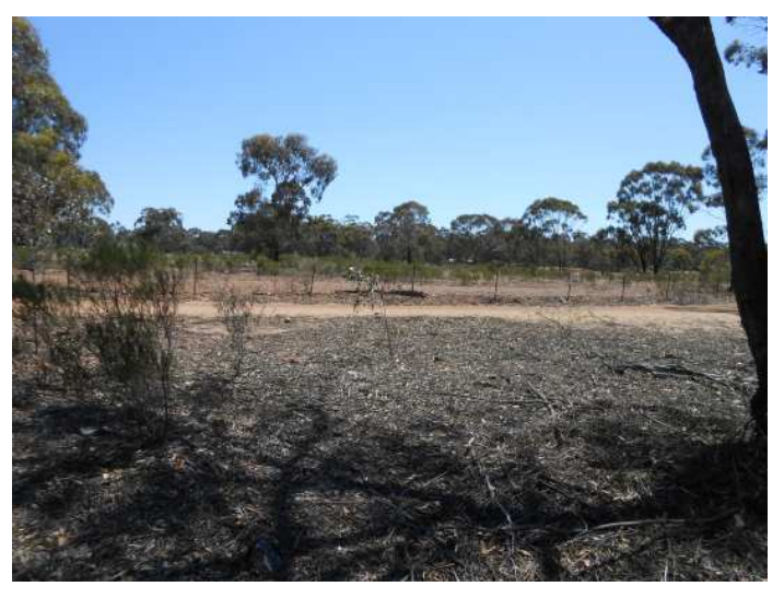
Typical Vegetation South-West

ALLIED DESIGN Consultants Page 5 of 6 Ref: 23782 – Lots 52 to 58