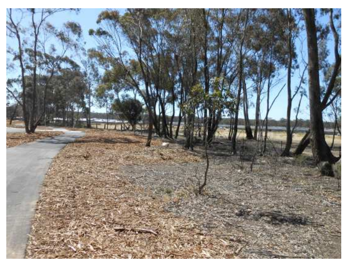
Typical Vegetation North-East