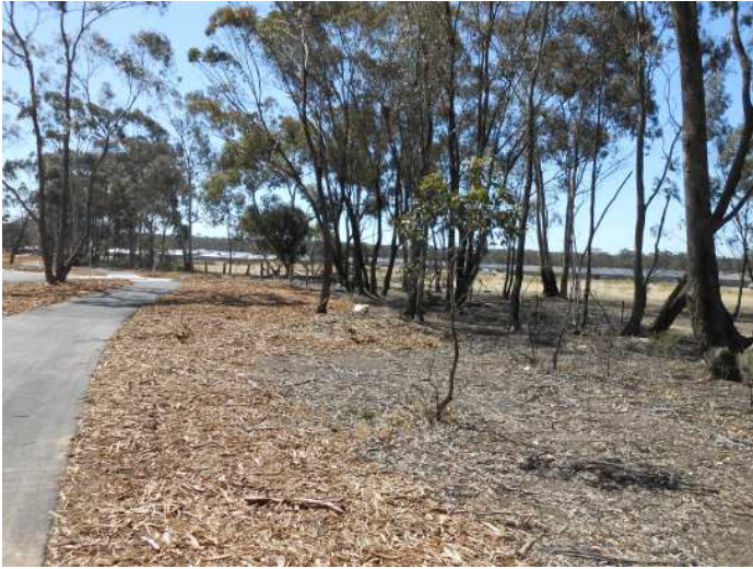
Typical Vegetation North-East