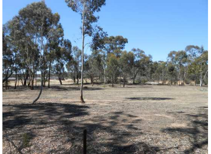
Typical Vegetation North-East