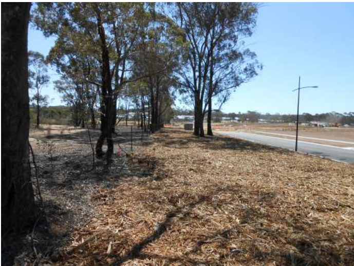
Typical Vegetation South-West