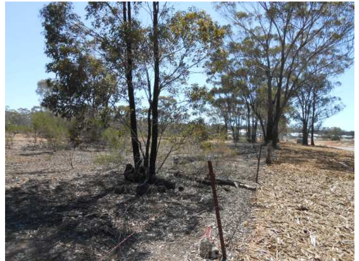
Typical Vegetation South-West