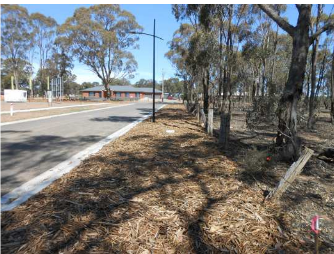
Typical Woodlands South-West