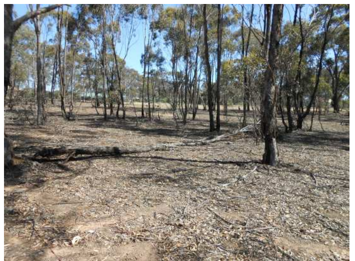
Typical Woodlands South-West